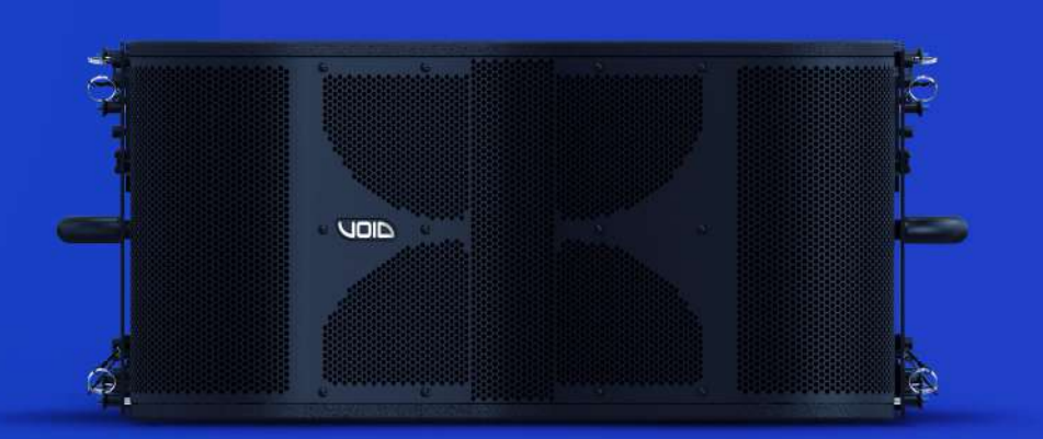
Products in this range include: Arcline 118, Arcline 212 and Arcline 218.